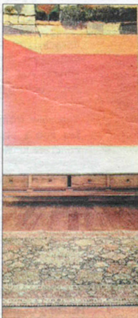
Natural touch: Wood plays an integral role in this tropical resort home as seen in the flooring and furniture elements.